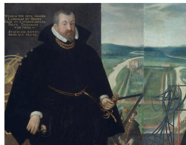
Fig. 1. Wilhelm IV (1532-1592), ruling as Landgrave from 1567. His first instruments, a quadrant and a torquetum, are seen at lower right. The globe behind him at left served for computing and for recording the stars.