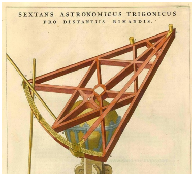
Fig. 3. Tycho Brahe's wooden sextant of 155 cm radius from about 1582.