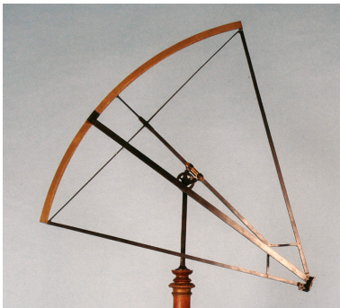
Fig. 4. A brass sextant of 1145 mm radius as used in Kassel from 1585 for producing the catalogue of 384 stars. The elegant metal construction is quite different from the massive wooden instrument of Tycho Brahe.

Tycho decided to dedicate his time to astronomy, a very unusual occupation for a nobleman as he was and therefore with obligations to serve his king. In a search for the best place in Europe to settle as astronomer Tycho went on a long journey in 1575. The first person to visit was Wilhelm in Kassel where he stayed for ten days. Wilhelm was so impressed by the young man, 29 years of age and famous for his book, that he sent message to the Danish king Frederik II (1534-1588), urging him to support this genius. Frederik in return sent a delegation to Kassel